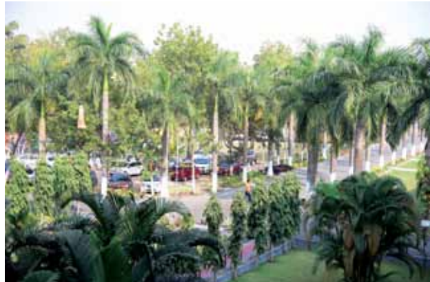
Lawn and Parking Area - Azara Campus