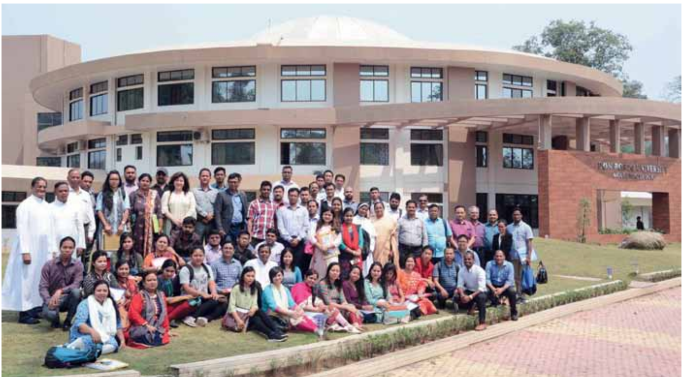
PhD Students - 2019 Batch

The admission process for the PhD programmes generally starts in December of every year. A separate notification and prospectus will be issued, which candidates can access from www.dbuniversity.ac.in .