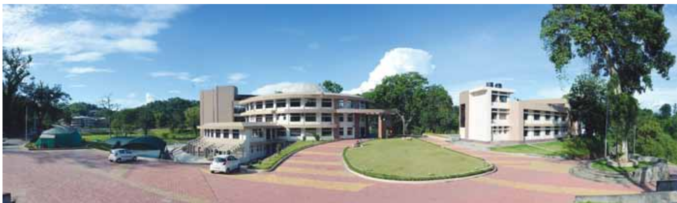
Panoramic View of Academic Block I