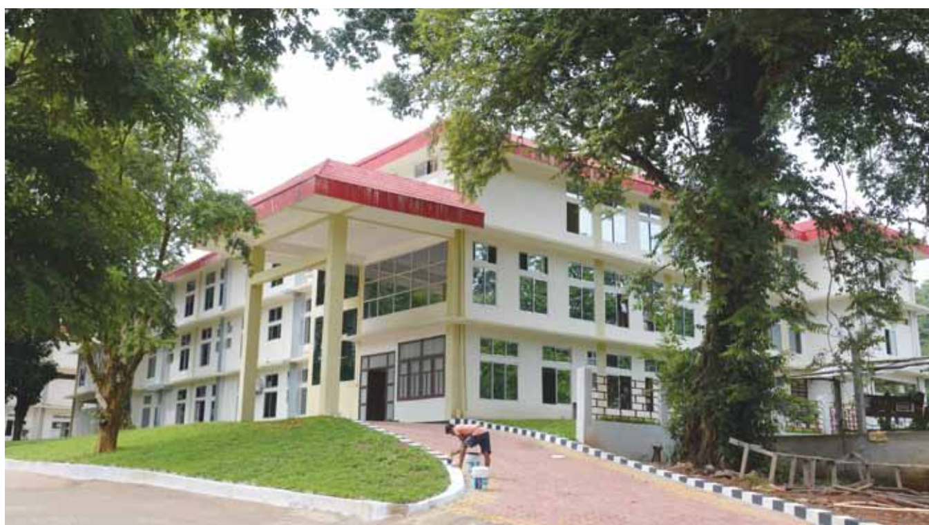
Men's Hostel II -Tapesia Campus

The University makes all efforts to facilitate bank loans for candidates desiring to avail of this facility. (For further details log on to: http://www.ugc.ac.in/page/Educational-Loan.aspx )