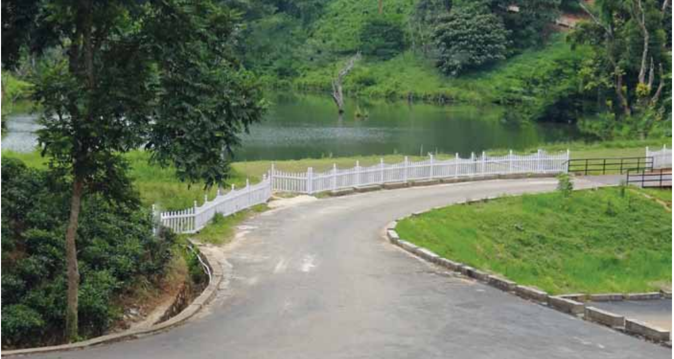
Major Fresh Water Reservoir I - Tapesia Campus