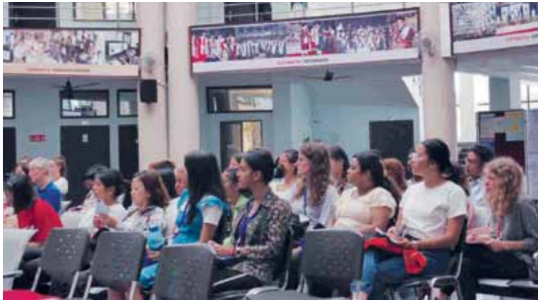
International Summer School with Frankfurt University of Applied Sciences, Germany