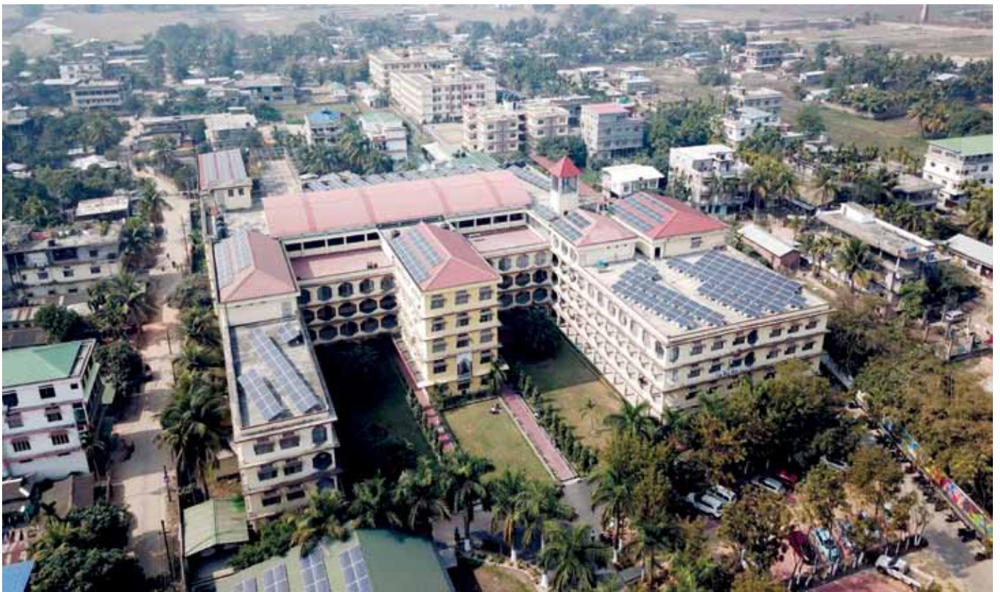
Aerial View - Azara Campus