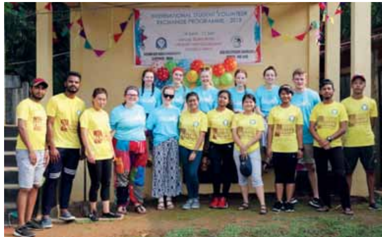
International Student Volunteers Exchange Programme with University College Dublin Volunteers Overseas, Ireland