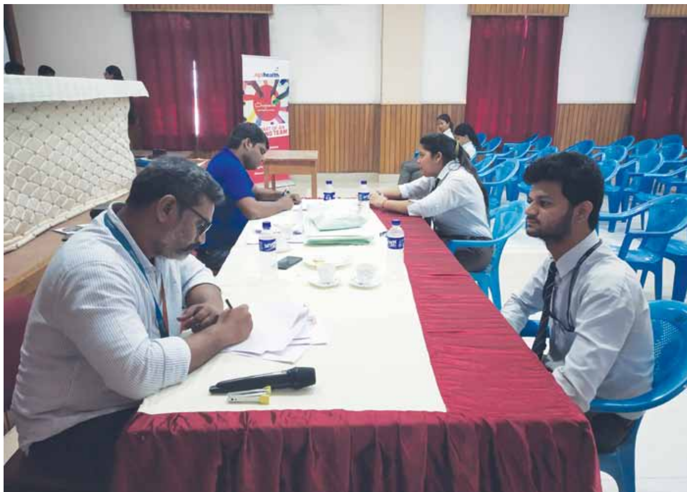
On-campus interview at Azara Campus

The Placement Team at ADBU constantly strives to create and grasp every opportunity for generating employment opportunities for the students. It works in close coordination with the students, who also form an integral part of the team, to ensure that our students get the maximum exposure to the corporate world. Some of the industries, companies and recruiting agencies who keep visiting the University campus are given on the next page.