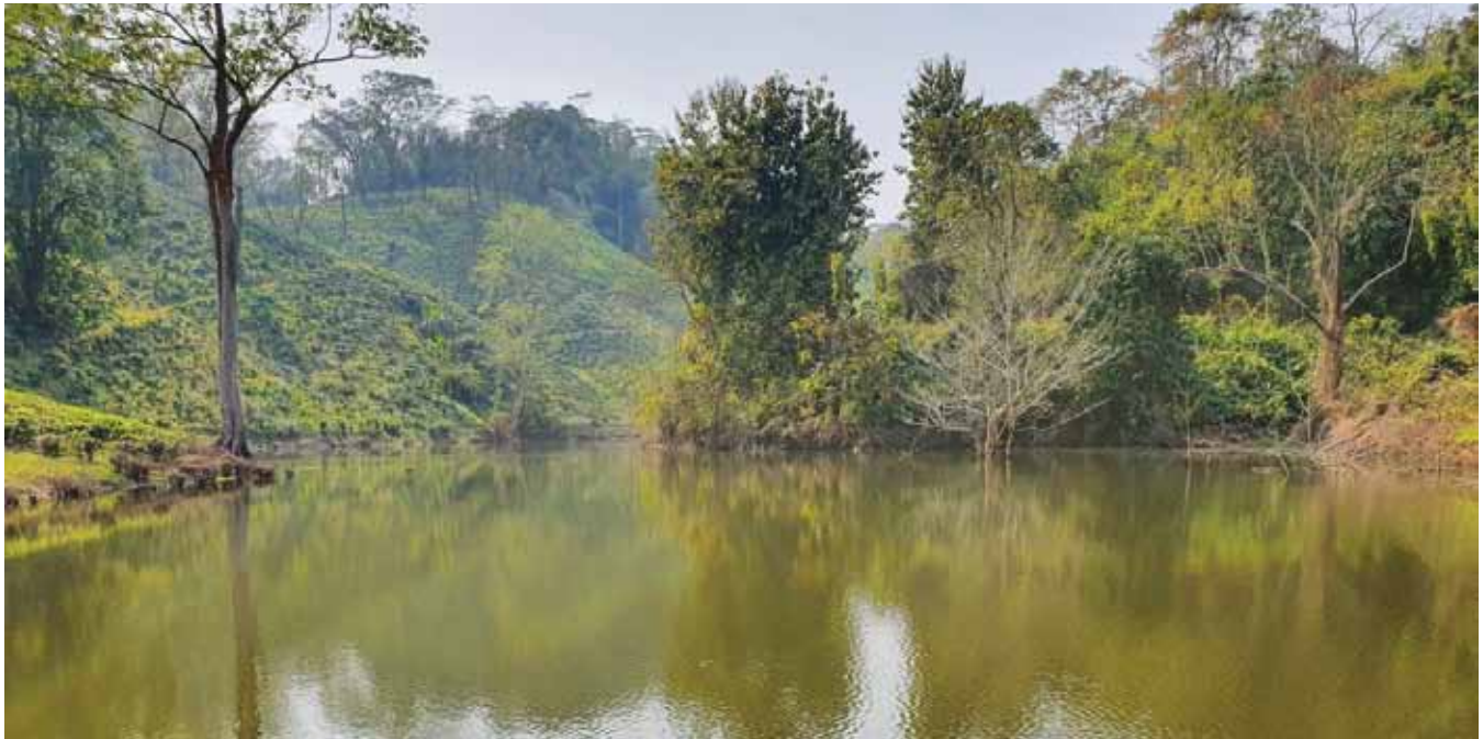
Major Fresh Water Reservoir II - Tapesia Campus