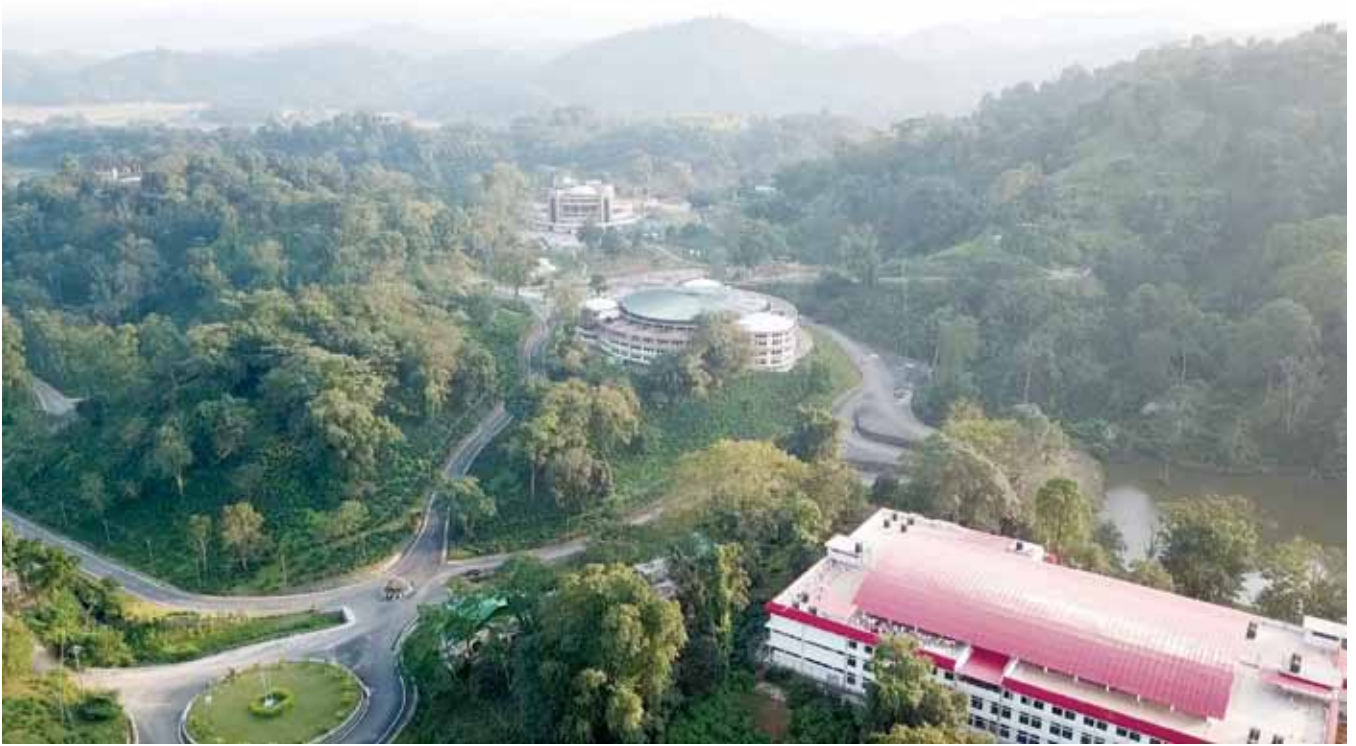
Aerial View of Tapesia Campus