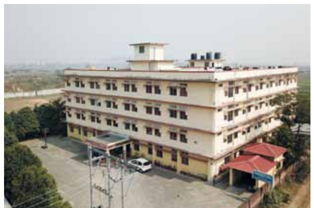
Women's Hostel - Azara Campus