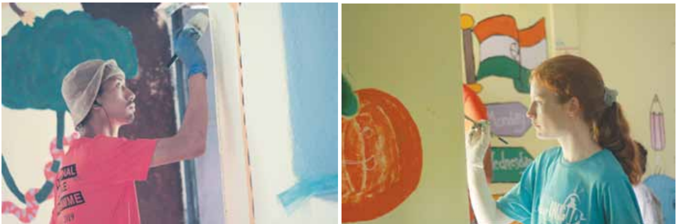
Student Volunteers from ADBU and University College Dublin, Ireland reinovating Anganwadis

The Student Volunteer Programme in collaboration with University College Dublin, Ireland, envisages promoting understanding of development concerns of marginalised and underprivileged communities. The programme includes academic engagements as well as field applications, focusing on promoting the spirit of appreciation for different cultures. It enables the participants to share learning and experience in the areas of participatory community development and social outreach.