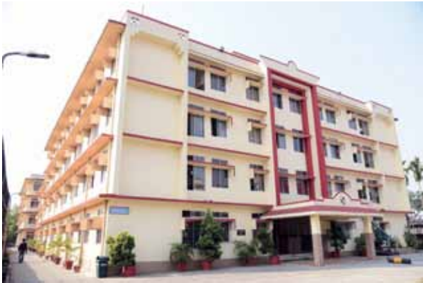
Men's Hostel - Azara Campus